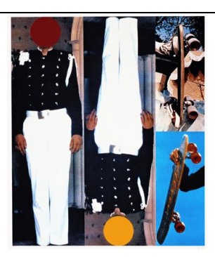
John Baldessari, Two Erect Figures / Two Skateboards, 1995, screenprint, collection of the Jordan Schnitzer Family Foundation